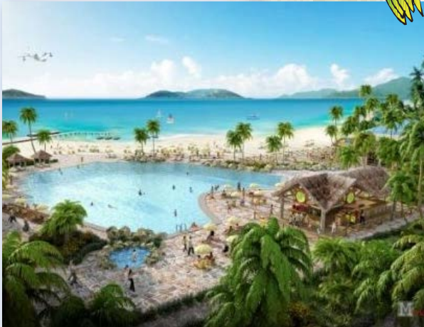
Artist's Rendering of Margaritaville Vacation Club

The 25-acre resort has 1000 feet of beachfront on Water Bay, aka Pineapple Bay, and promises changes in attitudes. Good tunes and fine tequila, too, no doubt.