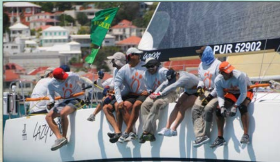
Puerto Rico's Lazy Dog.